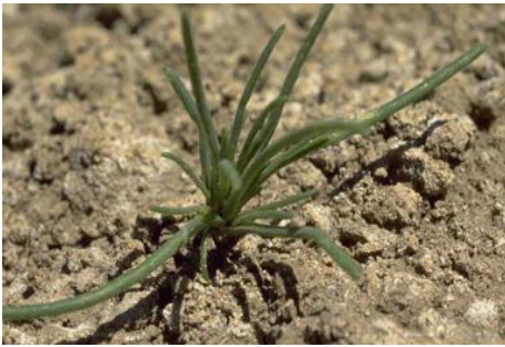
Figure 1. Russian thistle seedling.