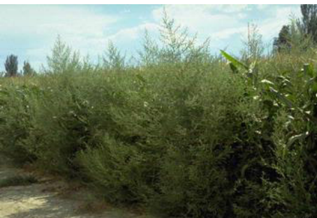
Figure 3. Mature kochia.