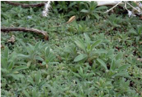
Figure 2. Kochia seedlings.