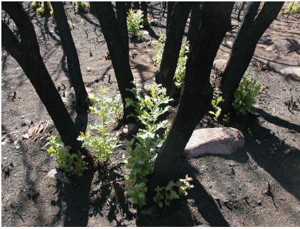
Figure 5. Oak brush resprouting after fire.