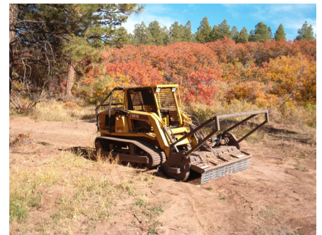
Figure 4. Mechanical treatment using a timberaxe.