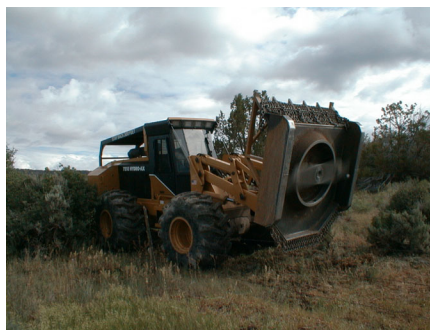
Figure 3. Mechanical treatment using a Hydroaxe®.

Thinning oak brush by hand can be time consuming and labor-intensive due to the density of the vegetation. Prolific sprouting follows cutting unless herbicides are applied to the cut stumps. Mechanical treatments such as chaining, root plowing, dozing, and roller-chopping are somewhat expensive and cannot be used on steep slopes. Various forms of mastication equipment can also be used on oak brush such as a Hydroaxes®, Bull Hog® mowers, timberaxes, or Fecon® rotary cutting heads. Sprouting also follows these mechanical treatments even when the overstory is completely removed and additional action is needed if oak control is desired. Mechanical treatment can also make the site susceptible to weed invasion.