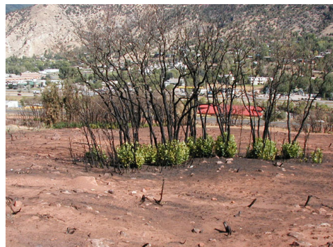
Figure 2. Oak brush sprouting after fire.

Gambel oak rarely reproduces from acorns; most reproduction is vegetative with sprouts occurring from a deep, extensive root system. Clones of oak brush spread slowly but stubbornly persist in previously colonized areas.