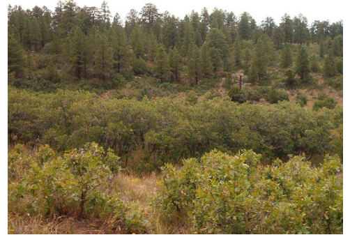
Figure 1. Typical oak brush growth in Colorado.

Gambel oak ( Quercus gambelii ), commonly found throughout western Colorado between 6,000 and 9,000 feet in elevation, generally dominates the region between the lower piñon-juniper zone and the aspen or ponderosa pine zone above. This shrub can be found throughout southern Colorado and along the Front Range almost to Denver. Gambel oak is usually found in conjunction with serviceberry ( Amelanchier alnifolia ), snowberry ( Symphoricarpos oreophilus ), mountain mahogany ( Cercocarpus montanus ), chokecherry ( Prunus virginiana ) and a variety of forbs and grasses. In south-central Colorado, oak brush is often associated with sumac and New Mexico locust.