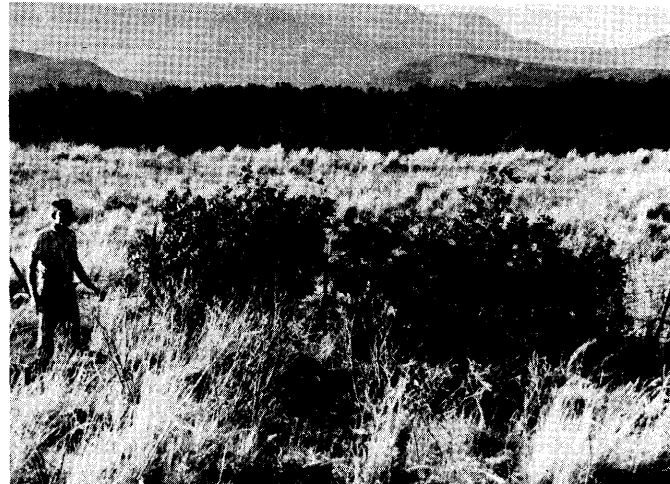
Fig. 1. Growth of oak in enclosure ten years after root plowing. Goat grazing has completely eliminated oak on the outside of the enclosure.

1 Percent sprout kill in the mechanically treated areas; percent dead stems to goat browse line in the undisturbed areas.